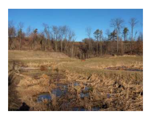
Boggs Run Treatment Facility Montour Run Watershed Allegheny County

For the latest round of Growing Greener Watershed Restoration Grants, the Department of Environmental Protection is asking applicants to estimate the economic value and employment to be generated by a project, in addition to the most important value – how much they will cleanup the environment.