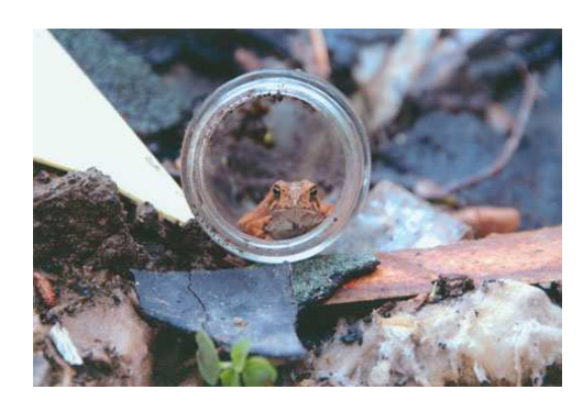
2004 winner by Karen Hohman

The <u>Pennsylvania Resources Council</u> invites student and adult amateur photographers from the around the state to be part of the 24th annual <u>Lens On Litter Contest</u> designed to highlight litter and illegal dumping problems in the Commonwealth.