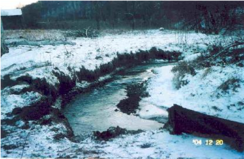
Rocky Run before restoration work began.