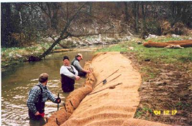
Fiber matting and bio-logs to stabilize stream bank.