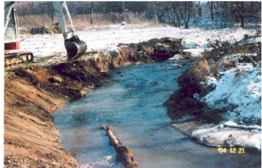
Restoration starts with grading, shaping stream banks.